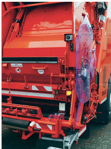
transparent cover plates