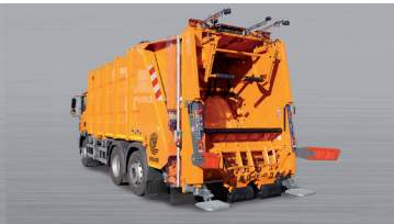
ROTARY III -2406