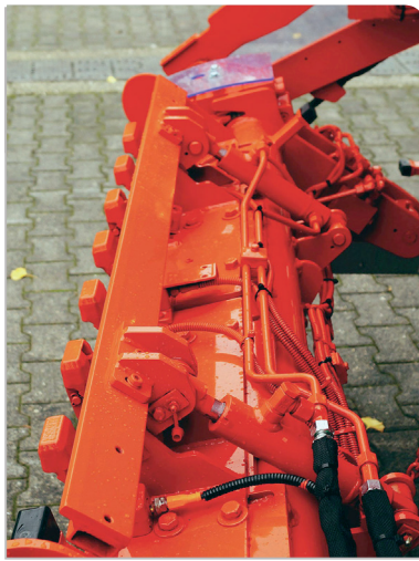
active container locking