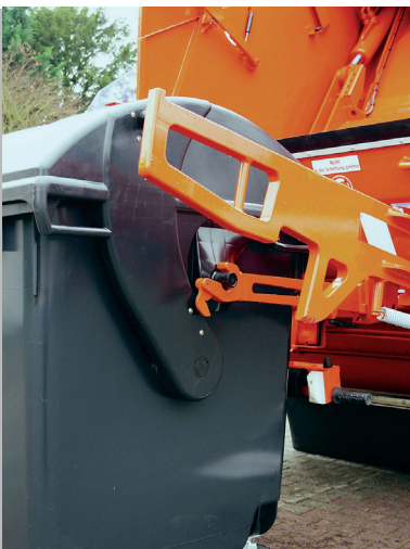
integrated folding arms