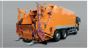
MEGA - 456