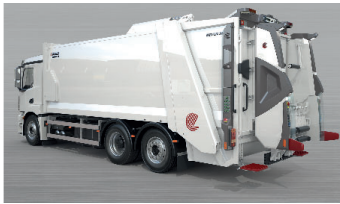
DELTA - 2318