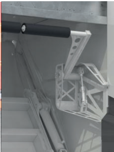
Container retention system