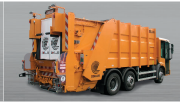
GAMMA - 2349