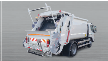
OMEGA - 359